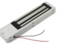
Electric Door Release