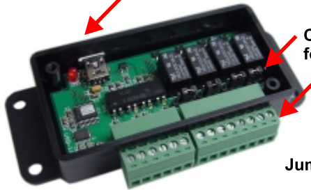
Contact Closure Jumpers for N/O, N/C operation