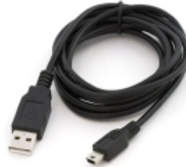
Mini USB to USB Cable