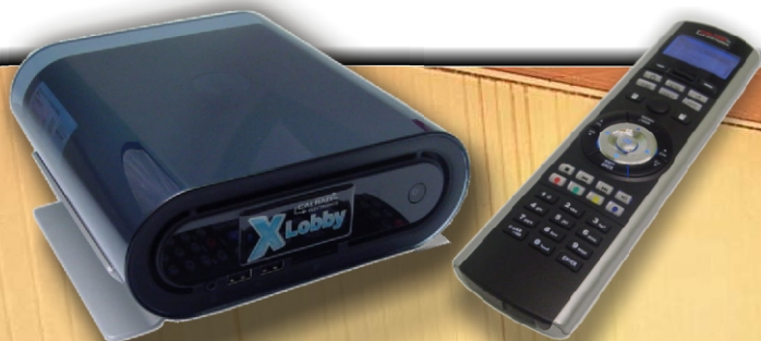
Small Compact Mini xLobby Control System

xLobbys integrated control solutions enhance your communication experience by automating and controlling environmental controls like HVAC, lighting presets and window treatments, audio / video equipment such as projectors and projection screens, DVDs and VCRs, Microphones, Cameras, Audio, Digital storage media, computers and internet access. Interface with and control room devices using IR/RF handheld presentation controller or by inwall or desktop touchscreens.