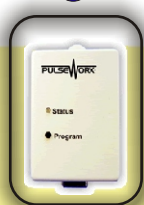
PIM-R RS232 Interface Module