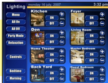
xLobby Lighting Screenshot