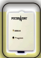
PIM-R RS232 Interface Module