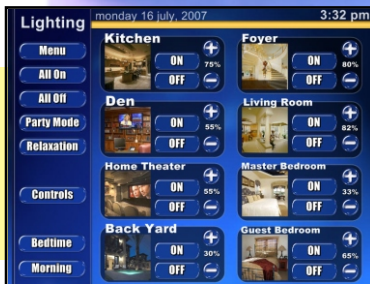
xLobby Lighting Screenshot